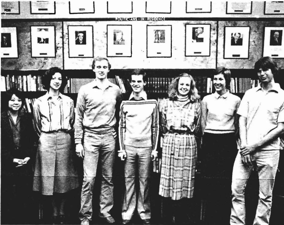
"Hosts for Coffee and Politics and Books and Banter"