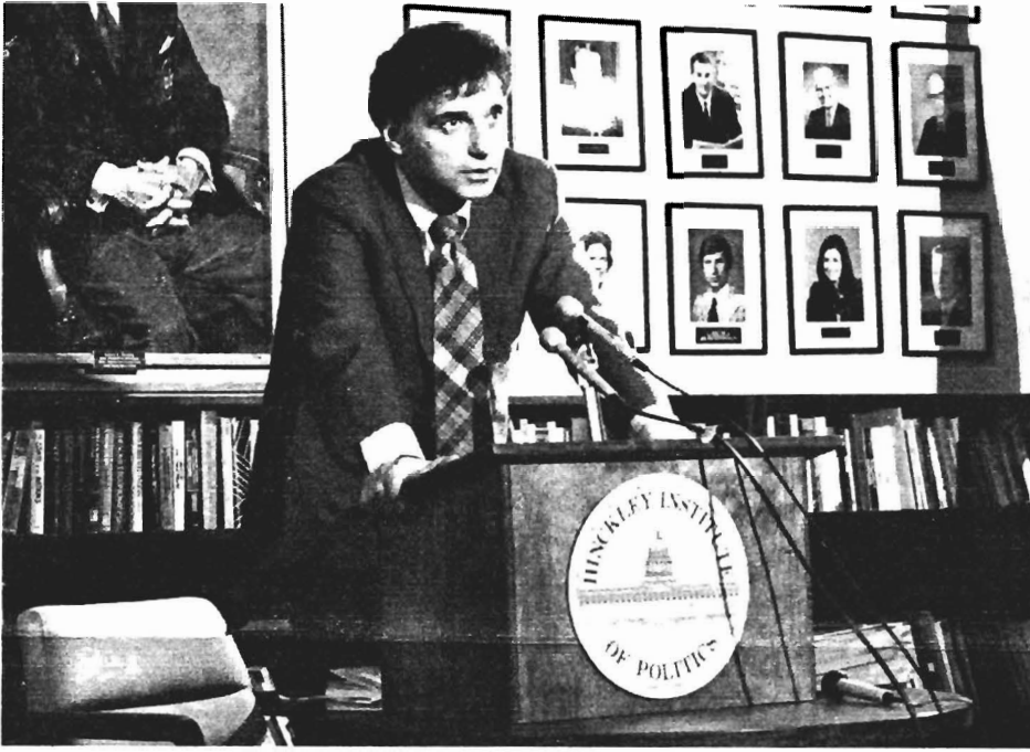
Consumer advocate Ralph Nader during press conference at Hinckley Institute.