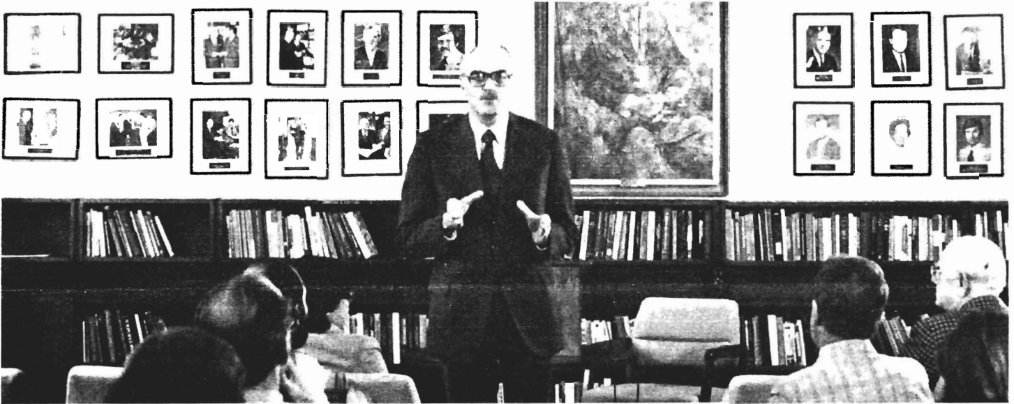
A discussion at Coffee and Politics led by Governor Scott M. Matheson

Contemporary political and public affairs issues are what the weekly Coffee and Politics sessions are all about. Informal, open forums bring students, faculty and other interested persons together to discuss local, state and national issues affecting the people of Utah.