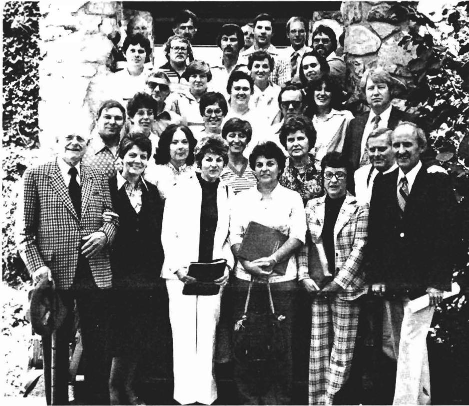
Taft Seminar participants, summer 1979.